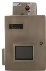
Z-purge Unit Class I, Division 2