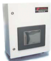
General Purpose Unit