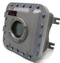
ExProof Unit Class I, Division 1, ICEx, ATEX pending